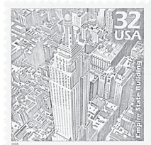
This 1998 stamp is from the Celebrate the Century: 1930s Sheet.