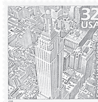
This 1998 stamp is from the Celebrate the Century: 1930s Sheet.