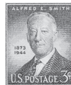
This stamp was issued in 1945 – the year after Smith died.

Smith died at the Rockefeller Institute Hospital on October 4, 1944. Many buildings in New York were later named in his honor, as well as parks, a fireboat, and a military installation. And the Al Smith Dinner, a white tie fundraiser, is held in New York City every year to raise funds for Catholic Charities.