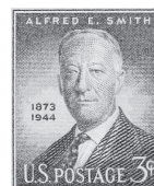
This stamp was issued in 1945 – the year after Smith died.

Smith died at the Rockefeller Institute Hospital on October 4, 1944. Many buildings in New York were later named in his honor, as well as parks, a fireboat, and a military installation. And the Al Smith Dinner, a white tie fundraiser, is held in New York City every year to raise funds for Catholic Charities.