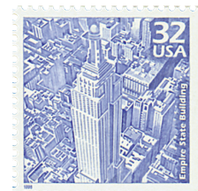
1998 stamp from the Celebrate the Century: 1930s Sheet.