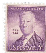
This stamp was issued in 1945 – the year after Smith died.

Smith died at the Rockefeller Institute Hospital on October 4, 1944. Many buildings in New York were later named in his honor, as well as parks, a fireboat, and a military installation. And the Al Smith Dinner, a white-tie fundraiser, is held in New York City every year to raise funds for Catholic Charities.