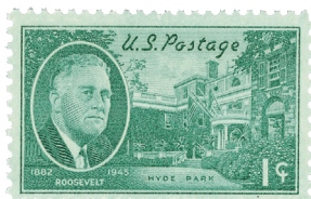
1945 stamp pictures FDR and his birthplace, Hyde Park.

Then in 1918, Smith was elected governor of New York. His opposition to publisher William Randolph Hearst cost him re-election in 1920, but he managed to win back his seat again in 1922, 1924, and 1926. His campaign manager and ally was James A. Farley (future postmaster general made famous through Farley's Follies).