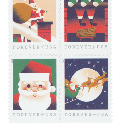
Set of 2021 stamps titled "A Visit From St. Nick," featuring scenes from the famed poem.

Four handwritten copies of Moore's poem remain today.