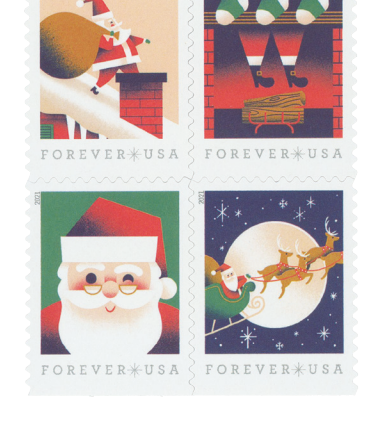
Set of 2021 stamps titled "A Visit From St. Nick," featuring scenes from the famed poem.

Four handwritten copies of Moore's poem remain today.