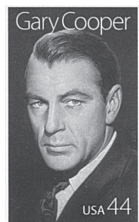
Cooper played York in the movie about his life.