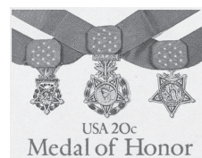
This stamp pictures the Army, Air Force, and Navy/Coast Guard/Marines Medals of Honor.