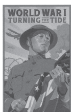
This stamp was issued in 2018 for the 100th anniversary of WWI.