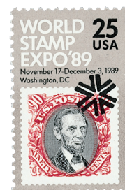
Issued in advance of the show to promote it.

World Stamp Show '89 ran for 14 days over a 17-day period, until December 3.