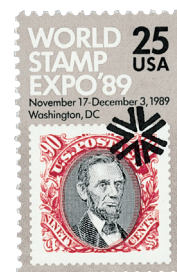
Issued in advance of the show to promote it.

World Stamp Show '89 ran for 14 days over a 17-day period, until December 3.