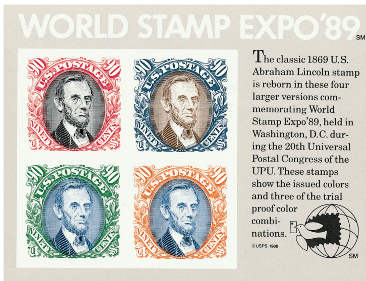
These stamps paid the one-ounce international airmail letter rate.