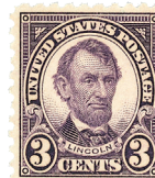
From the Series of 1923-26