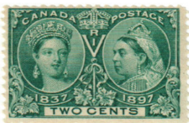
Issued for Queen Victoria's 60th anniversary as queen.