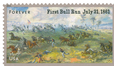
The first stamps issued in the Civil War Sesquicentennial Series.