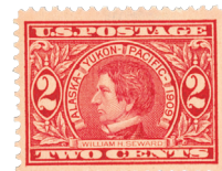
Issued for the 1909 Alaska-Yukon Pacific Exposition.