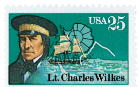
From the Antarctic Explorers issue