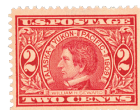
Issued for the 1909 Alaska-Yukon Pacific Exposition.