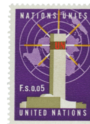
Geneva's first UN stamp picturing the UN Headquarters in Geneva

The Geneva branch of the UNPA was opened at the Palais des Nations on October 4, 1969. The Geneva headquarters issued stamps denominated in Swiss francs. Ten years later, the Vienna headquarters began issuing UN stamps denominated in Austrian schillings (now Euros are used). Treaties between the agency and the three nations guarantee that the UN Post Office classes and postage correspond to those at any United States, Swiss, or Austrian post office. Each country's postal agency also receives revenue from the sale of UN stamps to offset the cost of processing the mail.