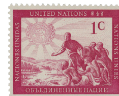
The first UN stamp titled Peoples of the World.

In 1949, Secretary-General Trygve Lie supported Arce's idea and contacted the US to see if the proposal was feasible. An agreement was reached that required UN stamps to be issued in US denominations for use only at United Nations Headquarters in New York City.