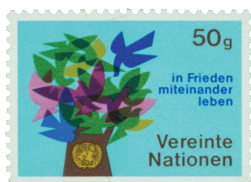
Vienna's first stamp titled Live Together in Peace

The United Nations profits directly when collectors purchase stamps for philatelic purposes. From the beginning, demand for UN stamps has been very strong. In 1976, the UNPA issued stamps from its New York and Geneva offices to celebrate its 25th anniversary. Three of the four denominations sold out the first day, and the fourth became unavailable within two and a half months. The New York Times ran a front-page article in 1979 featuring the International Year of the Child stamp, which also sold out on the day of issue.