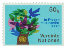
Vienna's first stamp titled Live Together in Peace

The United Nations profits directly when collectors purchase stamps for philatelic purposes. From the beginning, demand for UN stamps has been very strong. In 1976, the UNPA issued stamps from its New York and Geneva offices to celebrate its 25th anniversary. Three of the four denominations sold out the first day, and the fourth became unavailable within two and a half months. The New York Times ran a front-page article in 1979 featuring the International Year of the Child stamp, which also sold out on the day of issue.