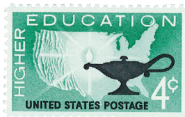
Dewey founded or helped found four institutes of higher learning.

Dewey eventually came into disagreement with the university's administration and resigned in 1904. From then until his retirement in 1930, he taught philosophy at Columbia. He was elected president of the American Psychological Association in 1899 and the American Philosophical