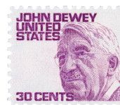
Issued one day after Dewey's 109th birthday.

Dewey died from pneumonia on June 1, 1952. Several schools were named after him as well as an education award. One historian said that "Dewey has been to our age what Aristotle was to the later Middle Ages, not a philosopher, but the philosopher."