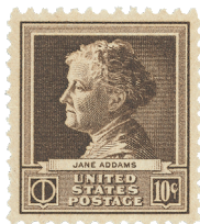
Dewey supported and was on the board of Jane Addams's Hull House.

Dewey helped found the New School in New York City in 1919. His ideas also inspired the founding of Bennington College (1932) and Goddard College (1938), where he was on the Board of Trustees. His theories also inspired the founding of the short-lived Black Mountain College (1933) in North Carolina. During his career, he published over 1,000 works including books, articles, and essays. His works include Democracy and Education (1916), Reconstruction in Philosophy (1920), Experience and Nature (1925), and Art as Experience (1934).