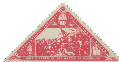
Triangle educational seal picturing Molly Pitcher