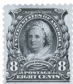
The first US stamp to honor an American woman.

In the spring, Mary's husband began training as an artilleryman under Baron von Steuben. Mary and the other women were tasked with providing a constant supply of water. The water was used to cool down the hot cannon barrels and soak the end of the ramrod. Mary may have received the famous nickname at this time. "Molly" was a common nickname for Mary and they may have called to her whenever they needed a pitcher of water – "Molly! Pitcher!"