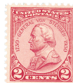
Stamp issued for General von Steuben's 200th birthday.