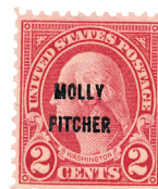
An overprinted stamp from the Series of 1922-23.

The "Molly Pitcher" stamp is an overprint on the regular 2¢ value of the 1922-23 Series. This overprint and others issued as commemoratives in 1928 caused confusion even in US post offices when they were mistaken for canceled regular issues stamps!