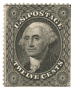
From the first series of perforated US stamps.