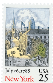
Stamp pictures Federal Hall and Trinity Church in NYC.

Many of the colonists were outraged and protested against taxation by Parliament, because they had no one to represent them. In response British goods were boycotted, customhouses were vandalized, and tax collectors were attacked. In England, merchants whose products were boycotted pressured Parliament to repeal the act. The "Sons of Liberty" secret society was formed within the colonies to coordinate protests. Effigies were burned under the "Liberty Tree" in Boston, and fear kept many tax distributors from selling the stamps. In New York, the Stamp Act was printed with a skull and cross bones (instead of the royal coat of arms) and paraded through the streets as "England's Folly and America's Ruin."