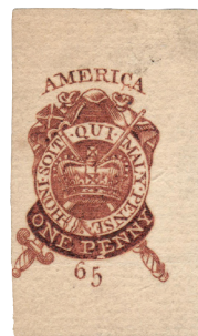
1865 Centennial Expo reproduction of a 1765 British Revenue for Use in America