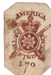
1765 2 pence British Revenue for Use in America Stamp Proof