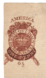
1865 Centennial Expo reproduction of a 1765 British Revenue for Use in America