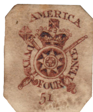
1765 4 pence British Revenue for Use in America Stamp Proof

That June, the Massachusetts Assembly sent a letter to the various colonies (including portions of present-day Canada, which was then known as the British West India islands) to arrange a meeting to discuss the situation. Nine colonies (Massachusetts, Rhode Island, Connecticut, New York, New Jersey, Pennsylvania, Delaware, Maryland, and South Carolina) ultimately selected delegates to attend the congress. Among the delegates were some familiar names: Robert R. Livingston and Caesar Rodney. Delegates traveled to New York City in late September and held their first meeting on October 7 at Federal Hall. The sessions continued for 14 days and were held behind closed doors and the journal of the congress deliberately kept the details to a minimum. But it is known that they extensively debated the Stamp Act and the differences between direct internal taxation and external taxation from Britain. In the end, they largely agreed that taxation should remain within the colonies.