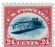
This stamp was pictured on the 1982 souvenir card.