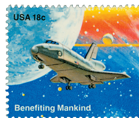
This stamp was also pictured on the first Stamp Collecting Month souvenir card.