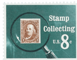
Stamp issued for the 125th anniversary of the first US stamp.

And whether or not a new set of stamps is issued each year, the USPS and local stamp groups often stage National Stamp Collecting Month events. Many years the USPS has also created special National Stamp Collecting Month cancellations.