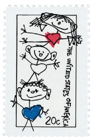
Stamp pictured on the 1984 souvenir card.

That first year, the USPS produced a souvenir card picturing two stamps – US #245, the $5 Columbian, and #1918, the 1981 “Benefiting Mankind” stamp from that year’s Space Achievement issue. The theme that first year was “Discover Stamp Collecting – the Hobby of a Lifetime.”