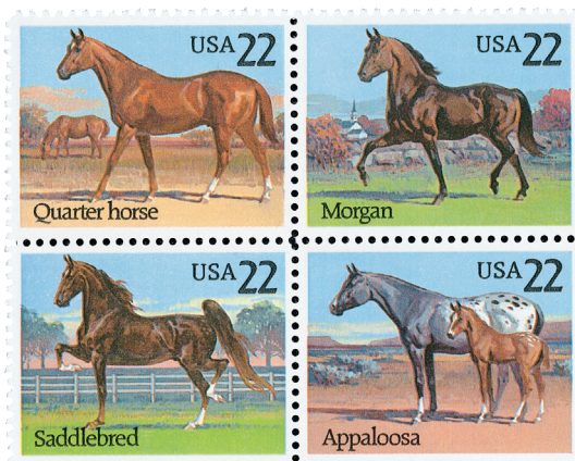
The first stamps issued specifically for Stamp Collecting Month, in 1985.