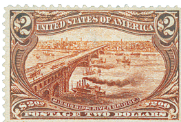
Trans-Mississippi stamp pictured on the 1983 souvenir card.