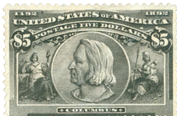
Columbian stamp pictured on the first National Stamp Collecting Month souvenir card in 1981.

The USPS and the Council of Philatelic Organizations created National Stamp Collecting Month in 1981. In announcing the annual celebration, then-Postmaster General William F. Bolger encouraged “employees and customers alike to discover the joy of stamp collecting – the hobby of a lifetime.”