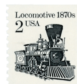
A steam locomotive stamp from the Transportation Series.

The Stockton-Darlington Railway remained in operation until 1863, when it was taken over by the North Eastern Railway.