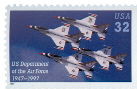
Stamp pictures F-16Cs of the Air Force's precision flying team, the Thunderbirds, flying in diamond formation.

With the motto, "Aim High... Fly-Fight-Win," the US Air Force has five core missions – air supremacy, intelligence and surveillance, rapid mobilization, strategic bombing, and command and control. Today it's the world's the largest air force and America's second largest service branch.