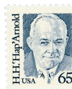
In 1949, Arnold was made the first five-star general of the Air Force.