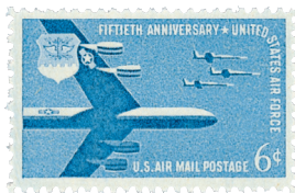
Stamp pictures the Boeing B-52 Stratofortress, which was first flown in 1952.