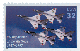
Stamp pictures F-16Cs of the Air Force's precision flying team, the Thunderbirds, flying in diamond formation.

With the motto, "Aim High... Fly-Fight-Win," the US Air Force has five core missions – air supremacy, intelligence and surveillance, rapid mobilization, strategic bombing, and command and control. Today it's the world's the largest air force and America's second largest service branch.