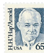
In 1949, Arnold was made the first five-star general of the Air Force.