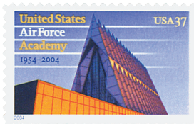
The US Air Force Academy was established in 1954.