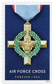
The Air Force Cross was established in 1960.