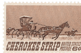
Issued for the 75th anniversary of the Cherokee land run.

More land runs followed and in 1907, the Cherokee and white settlers worked together to attain statehood.