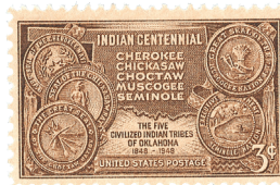
Issued for the 100th anniversary of the Five Civilized Tribes in Oklahoma.