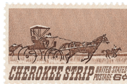
Issued for the 75th anniversary of the Cherokee land run.

More land runs followed and in 1907, the Cherokee and white settlers worked together to attain statehood.