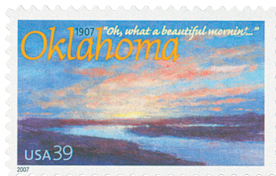
Oklahoma centennial stamp picturing sunrise on the Cimarron River and a line from the musical, Oklahoma.