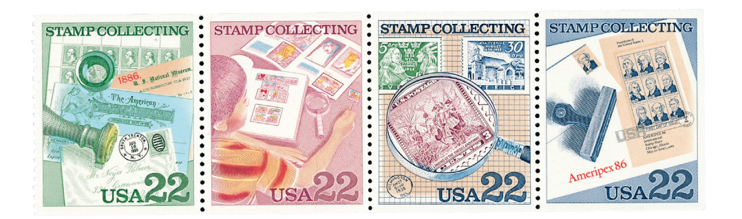
Issued for the 100th anniversary of the APS. It was the first US commemorative booklet and was on sale for just 60 to 90 days. Mystic Stamp Company • Camden, NY 13316