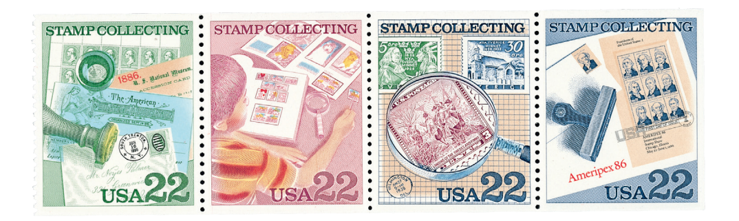
Issued for the 100th anniversary of the APS. It was the first US commemorative booklet and was on sale for just 60 to 90 days. Mystic Stamp Company • Camden, NY 13316