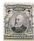
The first Series of 1902-03 stamp to go on sale.

Another significant issue that arose early in Harrison's term was tariffs. Over time, high tariff rates had built a significant surplus in the US Treasury. While Democrats wanted to lower rates, Republicans, including Harrison, sought to keep the rates high and spend the surplus on internal improvements and allow for the removal of some internal taxes. The resulting McKinley Tariff raised tariffs even higher. Harrison also passed the Sherman Antitrust Act, which bans specific business activities that reduce competition and additionally requires the federal government to investigate trusts and companies believed to be in violation.