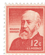
Harrison stamp from the Liberty Series.

One of Harrison's last actions as president was signing a treaty with Hawaii that would annex the island nation to the United States. Following an uprising of white businessmen there, the queen was removed and a new government put in place. Harrison supported annexation and wished to establish a naval base at Pearl Harbor. Although he submitted the bill to the Senate, they moved too slowly and President Cleveland rejected the treaty shortly after taking office.