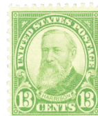
From the Series of 1926-31.