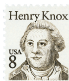
Issued on Knox's 235th birthday.

Numerous sites have been named after Knox, including the city of Knoxville, Tennessee. Counties in nine states have been named in his honor, and two military forts were also named for him.