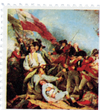
Bunker Hill 1775 by Trumbull US Bicentennial IOc