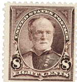
Sherman commanded the 3rd Brigade, 1st Division, of the Army of Northeastern Virginia