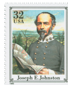
Johnston stamp from the 1995 Civil War sheet