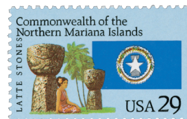
Issued in 1993 when the Northern Mariana Islands became a US Territory.