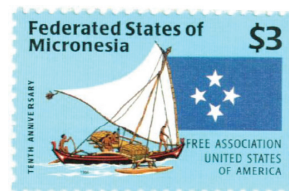
Issued in 1996 for the 10th anniversary of the compact and features the same design as the 1990 joint issue.