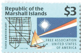
Also features the same design of the 1990 joint issue.