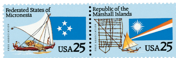
Issued in 1990 to celebrate the 1986 compact of free association with Micronesia and the Marshall Islands.

In 2003, the compacts with the Marshall Islands and Micronesia were renewed for 20 years, while financial aid for Palau is given through repeated Congressional resolutions.