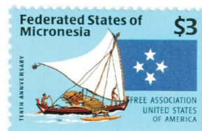
Issued in 1996 for the 10th anniversary of the compact and features the same design as the 1990 joint issue.