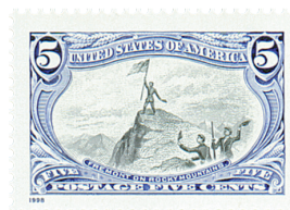
1998 Trans-Mississippi Reprint

In June 1856, Frémont became the first presidential candidate of the newly formed Republican Party. Although he had also been asked to be the Democratic presidential candidate, he refused because the party supported slavery. Fearing that his election would cause the Southern states to secede and possibly lead to a civil war, the Democrats strongly opposed his nomination. Although he carried eleven states, Buchanan, his Democratic rival, carried 19, and Frémont lost the election.