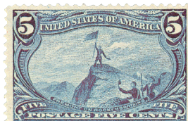
Stamp pictures Frémont raising the US flag over the Rocky Mountains.

War with Mexico was imminent when Frémont organized his second expedition to California in 1845. Aiding Commodore Robert Stockton and General Stephen Kearny in the conquest of California, he played an important role in the development of America’s 31st state. Settling there briefly, he gained significant wealth from the Gold Rush and served as one of the state’s first two senators.