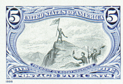
1998 Trans-Mississippi Reprint

Frémont also served during the Civil War. He was the commander of the Department of the West for five months before being dismissed by President Lincoln. Following the Civil War, Frémont retired from public life to devote himself to finding a possible transcontinental railroad route. In 1878, he was appointed territorial governor of Arizona, a position he held until 1881. In early July 1890, Frémont suffered from a brief illness brought on by a hot summer day. He died days later on July 13, 1890.