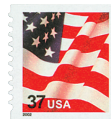
This stamp was printed by the BEP for the last time on June 10, 2005.

For about 75 years, the BEP produced nearly all US postage stamps (except for the 1943 Overrun Countries printed by the American Bank Note Company). This began to change in the late 1960s when the US Post Office began issuing contracts to private security printers. BEP stamp production dropped significantly, to less than 50% of all stamps in 1997. The last BEP-produced stamp was #3632, printed for the last time on June 10, 2005.