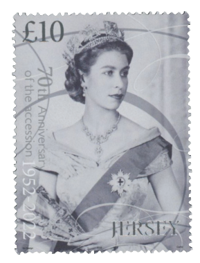
Issued for the 70th anniversary of Elizabeth's accession to the throne.

years, 214 days came to an end. It's the longest reign for any British monarch or female monarch.