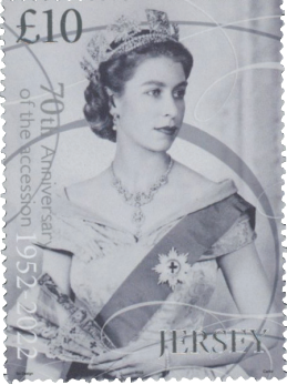
Issued for the 70th anniversary of Elizabeth's accession to the throne.

years, 214 days came to an end. It's the longest reign for any British monarch or female monarch.