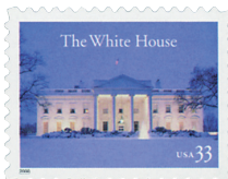
There have been 18 White House weddings to date.

On June 2, 1886, Grover Cleveland and Frances Folsom were married in the White House Blue Room, becoming the only president and first lady to wed in the Executive Mansion. Family, close friends, Cabinet members, and their wives were seated among an abundance of flowers. Crowds thronged the streets around the White House, John Philip Sousa led the Marine Band, church bells pealed across the nation's capital, and ships blew their horns in celebration. The president and his first lady then honeymooned in a private cabin at Deer Park Lodge, Maryland.