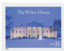
There have been 18 White House weddings to date.

On June 2, 1886, Grover Cleveland and Frances Folsom were married in the White House Blue Room, becoming the only president and first lady to wed in the Executive Mansion. Family, close friends, Cabinet members, and their wives were seated among an abundance of flowers. Crowds thronged the streets around the White House, John Philip Sousa led the Marine Band, church bells pealed across the nation's capital, and ships blew their horns in celebration. The president and his first lady then honeymooned in a private cabin at Deer Park Lodge, Maryland.