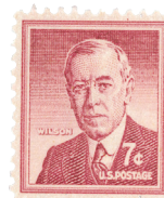
Wilson was married during his presidency, but the ceremony wasn't held at the White House.