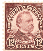
From the Series of 1926-31, which are considered some of America's most perfect postage stamps.

While Cleveland was the only president married in the White House, to date there have been 18 documented weddings held at the executive mansions. Nine have been the children of presidents, three were the niece or nephew of a president or first lady, as well as two siblings, two staffers, and the daughter of a friend. Some of these occasions, particularly the weddings of presidential children, are called "America's 'royal' weddings." Woodrow Wilson was married while he was president, but the ceremony was held elsewhere.