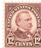
From the Series of 1926-31, which are considered some of America's most perfect postage stamps.

While Cleveland was the only president married in the White House, to date there have been 18 documented weddings held at the executive mansions. Nine have been the children of presidents, three were the niece or nephew of a president or first lady, as well as two siblings, two staffers, and the daughter of a friend. Some of these occasions, particularly the weddings of presidential children, are called "America's 'royal' weddings." Woodrow Wilson was married while he was president, but the ceremony was held elsewhere.