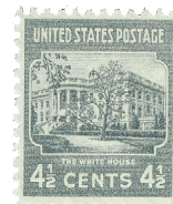
This stamp was also issued as part of the Prexies series.