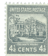
This stamp was also issued as part of the Prexies series.