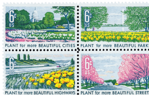
This block was issued for Lady Bird Johnson's Beautification of America program, encouraging people to take pride in their country to create more beautiful spaces.