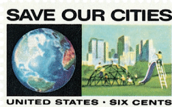
Air pollution is an important consideration for urban planners.

On May 7, 1917, the National Conference on City planning convened again. This time the attendees founded the American City Planning Institute, with Frederick Law Olmsted Jr. as their first president. In 1934, another national organization emerged, the American Society of Planning Officials (ASPO), which included not just planning consultants, but planning commissioners, city managers, and other public leaders. The ACPI changed its name to the American Institute of Planners in 1939.