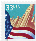
Flag and City stamp

The early 1900s brought an increased interest in improving American cities and towns. In 1901, New York passed a tenement law requiring buildings that housed three or more families to improve light, air quality, windows, courtyards, and more. The following year, Washington, DC adopted the McMillan Plan, to update the nation's capital with a focus on parks and monuments. This plan is sometimes considered one of the first examples of the US City Beautiful movement, which encouraged grandeur and beautification in city planning.