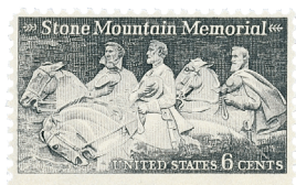
The Stone Mountain Memorial honors Confederate icons Robert E. Lee, Jefferson Davis, and Stonewall Jackson.