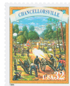
Chancellorsville stamp pictures two Union artillery batteries facing an overwhelming Confederate infantry.