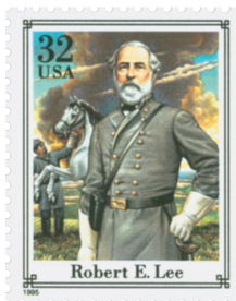
Stamp picturing Lee in his field uniform with his horse, Traveller.

What he faced was Robert E. Lee and his army of 61,000 – half the number of Hooker's force. Lee was fortified behind the Rappahannock, but not in an ideal position. Two divisions under James Longstreet were a distance away, encircling Suffolk in search of supplies, and too far to help once the battle began.