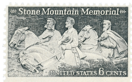
The Stone Mountain Memorial honors Confederate icons Robert E. Lee, Jefferson Davis, and Stonewall Jackson.