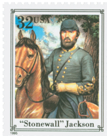
Stamp pictures Jackson on his horse, Little Sorrel.

By May 4, the bloody fighting at Chancellorsville ceased, as Fredericksburg became the focus of the most intense battles. The following day, Sedgwick's troops retreated north because of a miscommunication compounded by frayed nerves and sheer exhaustion. When he learned the Sixth Corps had retreated, Hooker realized the battle was over and he followed Sedgwick on May 6. The Battle of Chancellorsville is known as Lee's "perfect battle" because of his risky decision to divide his army in the face of a larger force and the Confederate victory he achieved. However, this victory was hampered by the death of Stonewall Jackson.