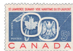
Canada joint issue of the US stamp above.

A joint project, Canada administers about 55 miles of canals and 13 locks while the US runs 10 miles of canals and two locks. The Saint Lawrence Seaway is the world's longest deep-draft inland waterway. The seaway extends 2,038 nautical miles from the Atlantic Ocean at Montreal to Lake Superior. The series of canals that form the seaway permits ocean-going vessels to receive and deliver goods in 15 ports in the US and Canada. In addition to shipping goods from America's heartland, the seaway also plays an important role in recreation and tourism.