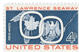
America's first joint-issue stamp.

The joint effort between Canada and the US finally received authorization to begin in 1954, when the St. Lawrence Seaway Development Corporation was formed. Construction of the St. Lawrence Seaway was nearly as ambitious as the Panama Canal project. Several villages and hamlets were flooded, and new towns were built for 6,500 displaced residents.