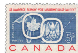
Canada joint issue of the US stamp above.

A joint project, Canada administers about 55 miles of canals and 13 locks while the US runs 10 miles of canals and two locks. The Saint Lawrence Seaway is the world's longest deep-draft inland waterway. The seaway extends 2,038 nautical miles from the Atlantic Ocean at Montreal to Lake Superior. The series of canals that form the seaway permits ocean-going vessels to receive and deliver goods in 15 ports in the US and Canada. In addition to shipping goods from America's heartland, the seaway also plays an important role in recreation and tourism.