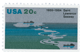
Stamp marking the 25th anniversary of the completion of the St. Lawrence Seaway.

The existing system of smaller waterways was excavated, altered, or replaced by a single system 27 feet deep. The St. Lawrence Seaway is widely considered as one of the greatest feats of engineering in the 20th century. In addition to building locks and channels, hydroelectric plants were also constructed, reaching a total cost of $470 million.