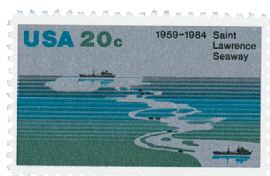
Stamp marking the 25th anniversary of the completion of the St. Lawrence Seaway.

The existing system of smaller waterways was excavated, altered, or replaced by a single system 27 feet deep. The St. Lawrence Seaway is widely considered as one of the greatest feats of engineering in the 20th century. In addition to building locks and channels, hydroelectric plants were also constructed, reaching a total cost of $470 million.