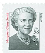
Margaret Chase Smith