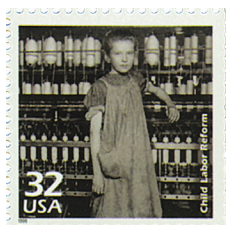
Stamp from the Celebrate the Century series.