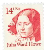
Julia Ward Howe