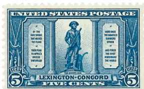
Stamp picturing the Minuteman statue in Concord as well as lines from Ralph Waldo Emerson's "Concord Hymn."

As resentment grew against their British governors, the colonists realized they might have to fight for fair treatment. Farmers, craftsmen, and shopkeepers began to organize and prepare for possible conflict. In the spring of 1775, British troops gathered in Boston. The colonials stored arms at nearby Concord, and drilled and readied themselves to fight "at a minute's notice."