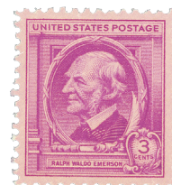
Emerson wrote "Concord Hymn" for the 1837 dedication of the battle monument in Concord.

The Revolution had begun. America's Second Continental Congress had to choose a commander-in-chief. It was considered necessary to appoint a Virginian to ensure full southern support for the cause. George Washington, a plantation owner, had