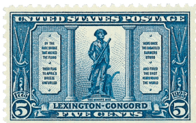
Stamp picturing the Minuteman statue in Concord as well as lines from Ralph Waldo Emerson's "Concord Hymn."

As resentment grew against their British governors, the colonists realized they might have to fight for fair treatment. Farmers, craftsmen, and shopkeepers began to organize and prepare for possible conflict. In the spring of 1775, British troops gathered in Boston. The colonials stored arms at nearby Concord, and drilled and readied themselves to fight "at a minute's notice."