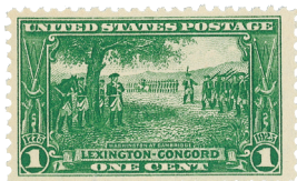
Though part of the Lexington-Concord issue, this stamp pictures Washington leading forces at Cambridge two months later.

As they began to leave their positions, someone – to this day no one is sure which side – fired a single shot. Musket fire then erupted from both sides. When it was over, eight minutemen were dead and ten wounded. Only one British soldier was wounded, but this brave first stand by American patriots helped to rally the colonies toward the cause of the revolution and focus the world's attention on the struggle.