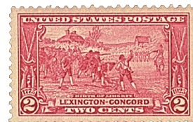
Stamp features an idealized image of the scene at Lexington by Henry Sandham titled, The Dawn of Liberty.

But the patriot underground in Boston sent messengers to spread the alarm. William Dawes, a tanner of shoe leather, and Paul Revere, a well-known silversmith, galloped through the night toward Lexington by different routes. Shouting, "The regulars are coming!" they woke minutemen in houses along the way. Patriots hurried out to face