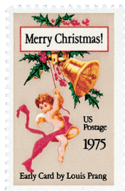
Christmas bell ringing dates back to 1891 in San Francisco.