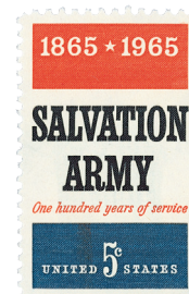
Stamp issued in 1965 for the organization's 100th anniversary.

The organization's goals include "The advancement of the Christian religion as promulgated in the religious doctrines – which are professed, believed and taught by the Army and, pursuant thereto, the advancement of education, the relief of poverty, and other charitable objects beneficial to society or the community of mankind as a whole." Today, the Salvation Army works in 133 different countries with 15,409 congregations and over 1.65 million members.