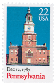
The first meeting in the US was held in Philadelphia, PA.