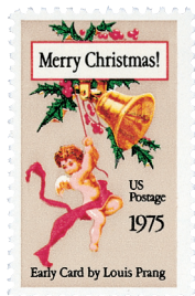
Christmas bell ringing dates back to 1891 in San Francisco.