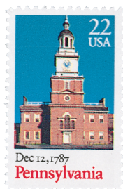
The first meeting in the US was held in Philadelphia, PA.