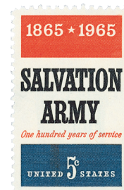
Stamp issued in 1965 for the organization's 100th anniversary.

The organization's goals include "The advancement of the Christian religion as promulgated in the religious doctrines – which are professed, believed and taught by the Army and, pursuant thereto, the advancement of education, the relief of poverty, and other charitable objects beneficial to society or the community of mankind as a whole." Today, the Salvation Army works in 133 different countries with 15,409 congregations and over 1.65 million members.