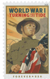
Stamp honoring US participation in WWI.