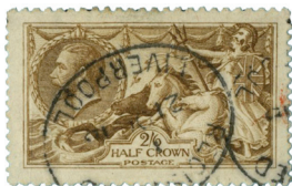
WWI-era stamp depicting Britannia, as Britain – "a ruler of the seas."

Though German prisoners warned the British about the coming offensive, they were unable to defend against such a massive attack. British and French troops had prepared and dug-in at some of the more strategic locations. Others were less defended – and this was where the Germans attacked. The Allies were forced into a fighting retreat but still managed to deliver significant enemy casualties. Within three days, the Germans opened a 50-mile-wide gap on the front, the greatest advance for either side in four years.