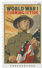
Stamp honoring US participation in WWI.