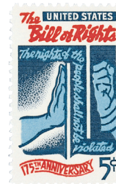
Warren's court made many decisions that incorporated the protections of the Bill of Rights in the state and local governments.