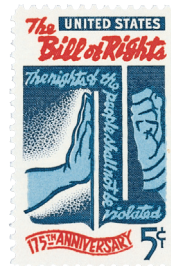
Warren's court made many decisions that incorporated the protections of the Bill of Rights in the state and local governments.