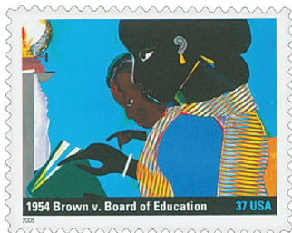
Warren delivered the court's opinion on the case of Brown vs. Board of Education.

In 1938, Warren was resoundingly elected attorney general of California. In that role, he reorganized the state's law enforcement into regions and launched a major anti-crime campaign. However, he also continued many of his predecessor's policies, including the confiscation of land from Japanese owners. When World War II began, he supported the internment of Japanese Americans. Though later in the war he deeply regretted his role in this, "because it was not in keeping with our American concept of freedom and the rights of citizens."