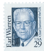
From the Great Americans Series

Warren retired from the court in 1968 and spent his time writing memoirs and giving speeches. He died on July 9, 1974. He was posthumously awarded the Presidential Medal of Freedom and several schools and buildings have been named in his honor.