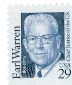
From the Great Americans Series

Warren retired from the court in 1968 and spent his time writing memoirs and giving speeches. He died on July 9, 1974. He was posthumously awarded the Presidential Medal of Freedom and several schools and buildings have been named in his honor.