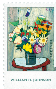
Part of the American Treasures Series, this stamp pictures Johnson's 1939-40 painting, Flowers.

In 1967, all of Johnson’s 1,300 paintings were donated to the Smithsonian Institution, where they were put on display, reviving interest and establishing him as a leading painter of his time. In 2001, the William H. Johnson Foundation for the Arts was established to mark his 100th birthday and began awarding annual prizes to African American artists. During his term as president, Barack Obama chose four of Johnson’s paintings to decorate the White House – the most by any single artist. His hometown of Florence unveiled a statue in Johnson’s honor in 2020.