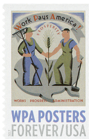
From the 2017 WPA Posters issue