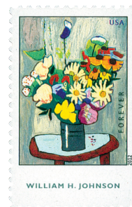
Part of the American Treasures Series, this stamp pictures Johnson's 1939-40 painting, Flowers.

In 1967, all of Johnson’s 1,300 paintings were donated to the Smithsonian Institution, where they were put on display, reviving interest and establishing him as a leading painter of his time. In 2001, the William H. Johnson Foundation for the Arts was established to mark his 100th birthday and began awarding annual prizes to African American artists. During his term as president, Barack Obama chose four of Johnson’s paintings to decorate the White House – the most by any single artist. His hometown of Florence unveiled a statue in Johnson’s honor in 2020.