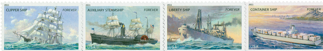
Stamps picture different types of Merchant Marine ships through the years.