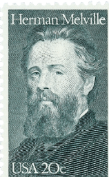
Melville wrote several stories inspired by his time as a Merchant Marine.