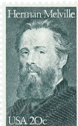
Melville wrote several stories inspired by his time as a Merchant Marine.