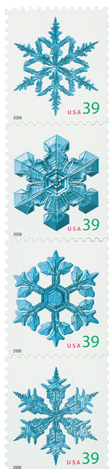
2006 Snowflake Stamps