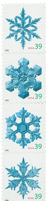
2006 Snowflake Stamps