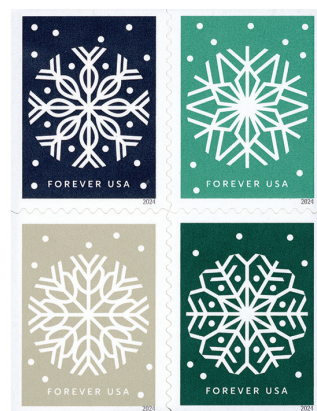
2024 Winter Whimsy Snowflake Stamps

issues of having the telegraph, water, and gas lines, as well as the trains above ground and began the process of moving them all underground.