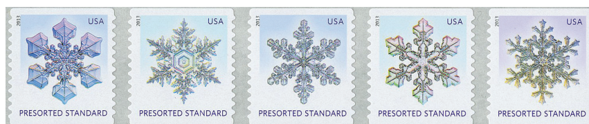
2013 Snowflake Stamps

By the time the storm ended, as much as 55 inches had fallen in some areas and over 400 people had died between Washington, DC, and Maine. Once the storm passed, officials recognized the