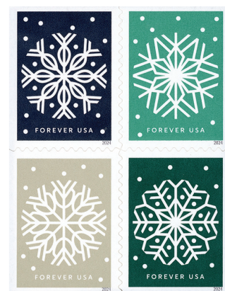
2024 Winter Whimsy Snowflake Stamps

issues of having the telegraph, water, and gas lines, as well as the trains above ground and began the process of moving them all underground.