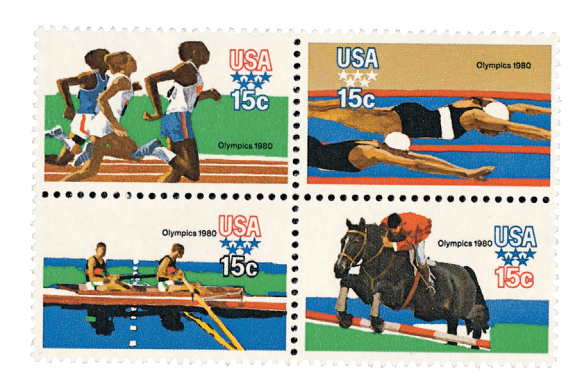
These stamps were issued on September 28, 1979, in Los Angeles, California.

Carter also imposed economic sanctions, a trade embargo, and led a boycott of the 1980 Summer Olympics in Moscow. Eventually, 65 other countries joined in the boycott as well. In spite of this, athletes from some of those nations still participated, playing under the Olympic Flag.