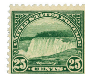
Du Bois was a leader in the Niagara Movement, named for their first meeting held in Ontario, Canada's Niagara Region.