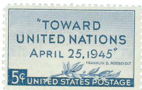
Du Bois was part of the three-person NAACP delegation to the 1945 United Nations Conference. They submitted a proposal to support racial equality and end the colonial era, but it was largely ignored.