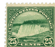
Du Bois was a leader in the Niagara Movement, named for their first meeting held in Ontario, Canada's Niagara Region.