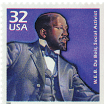
From the Celebrate the Century – 1900s Sheet