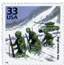
From the Celebrate the Century: 1950s Stamp Sheet

The 23rd Infantry Regiment arrived in advance of the People's Volunteer Army (PVA) and dug defenses, prepared artillery, and set up communications. Three battalions, including one from France, reinforced them. General Paul Freeman Jr. was in command of 4,500 men.