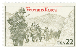
This stamp image was based on a 1950 photo of US troops retreating from Chosin Reservoir.

Chinese forces first entered Korea in November 1950. UN troops were caught off guard and uncertain of their intentions or capabilities and drew back to the 38th parallel. When it became obvious that the Chinese had overstretched their supply lines, General Matthew B. Ridgeway decided to make a stand at Chipyeong-ni, a key road intersection.