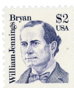
From the Great Americans Series

Three years later, White bought the Emporia Gazette for $3,000 and made himself the editor. In that role he shared his progressive ideals that would make him famous. Most notably, in 1896, White wrote an attack piece on William Jennings Bryan as well as Democrats and Populists that he called, “What’s the Matter With Kansas?”