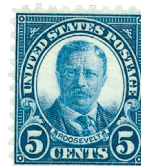
This stamp was first issued around Christmas 1924 in precanceled form.