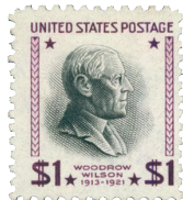
1951 Wilson Profile with US Internal Revenue watermark

White went on to serve as a reporter at the Versailles Conference in 1919 and a vocal supporter of the League of Nations as suggested by Woodrow Wilson. As a writer, White was popular around the nation for his humorous, honest, and commonsense writing. Many of his articles were reprinted and distributed around the country and syndicated in other newspapers.