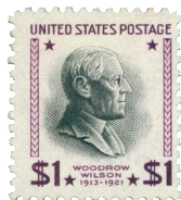
1951 Wilson Profile with US Internal Revenue watermark

White went on to serve as a reporter at the Versailles Conference in 1919 and a vocal supporter of the League of Nations as suggested by Woodrow Wilson. As a writer, White was popular around the nation for his humorous, honest, and commonsense writing. Many of his articles were reprinted and distributed around the country and syndicated in other newspapers.