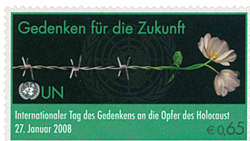
UN stamps honoring International Holocaust Remembrance Day