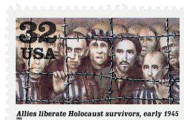
From the "1945: Victory at Last" World War II sheet

Fifty years later, the United Nations named January 27 as "International Holocaust Remembrance Day," to honor the victims of the Holocaust. Secretary-General Kofi Annan called the Holocaust "a unique evil that cannot simply be consigned to the past and forgotten."