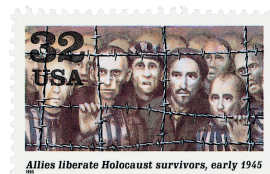
From the “1945: Victory at Last” World War II sheet

Fifty years later, the United Nations named January 27 as “International Holocaust Remembrance Day,” to honor the victims of the Holocaust. Secretary-General Kofi Annan called the Holocaust “a unique evil that cannot simply be consigned to the past and forgotten.”