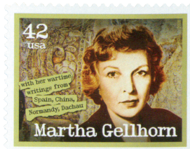
Martha Gellhorn stowed away on a boat to Normandy to report on the war, including the Battle of the Bulge.