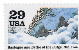
The only stamp in all of the US WWII sheets to picture a winter scene.

Following the battle, British Prime Minister Sir Winston Churchill stated, "This is undoubtedly the greatest American battle of the war and will, I believe, be regarded as an ever-famous American victory."