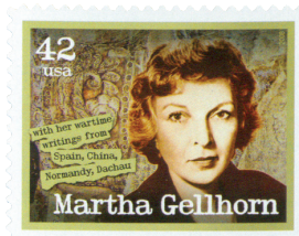
Martha Gellhorn stowed away on a boat to Normandy to report on the war, including the Battle of the Bulge.