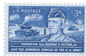
Patton led the US 3rd Army during the battle.