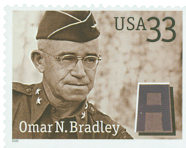
Bradley commanded the US 12th Army during the battle.

On July 25, 1944, Allied troops broke through German lines at Saint-Lô, France, and a month later, Paris was liberated after four long years of Nazi occupation. Driving forward, General George S. Patton pushed eastward toward the Rhine River, while British commander Bernard Montgomery swept into Belgium, capturing Antwerp on September 4th. By the late fall, US and British forces had managed to drive the Germans back to their own borders.