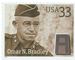
Bradley commanded the US 12th Army during the battle.

On July 25, 1944, Allied troops broke through German lines at Saint-Lô, France, and a month later, Paris was liberated after four long years of Nazi occupation. Driving forward, General George S. Patton pushed eastward toward the Rhine River, while British commander Bernard Montgomery swept into Belgium, capturing Antwerp on September 4th. By the late fall, US and British forces had managed to drive the Germans back to their own borders.