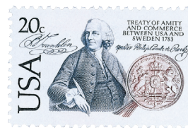
The 1983 Joint Issue with Sweden

Each booklet included four different designs. In the US booklet, the first stamp pictured a block of 12 green 1887 2¢ Washington stamps with an 1886 cancel. The second stamp showed a young boy with a collection of dog stamps, including several identifiable US stamps such as the 1982 Kitten and Puppy issue and the 1984 American Dogs set. The third stamp pictures the 1938 commemorative honoring Swedish and Finnish settlement. The fourth stamp pictures the Presidential sheetlets that would be issued that May – it was the first US stamp to picture a stamp that had not yet been issued.