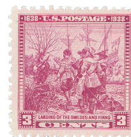
The 1938 Swedish-Finnish Tercentenary Stamp

The success of that issue led to talks of another joint-issue between the US and Sweden. During those talks, the president of the Swedish Post Office suggested that both countries issue stamps with philatelic subjects. In 1986, the US and Sweden were each going to host international stamp exhibitions (STOCKHOLMIA and AMERIPEX) and both nations were celebrating significant stamp anniversaries that year. For Sweden, 1986 marked the 250th anniversary of their post office and the 100th anniversary of the Swedish Philatelic Society. In America, 1986 was the 100th anniversary of the American Philatelic Society and the centennial of the Smithsonian accepting stamps for the National Collection.