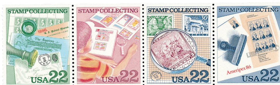
America's First Commemorative Booklet

On January 23, 1986, the USPS issued its first commemorative booklet, which honored stamp collecting.