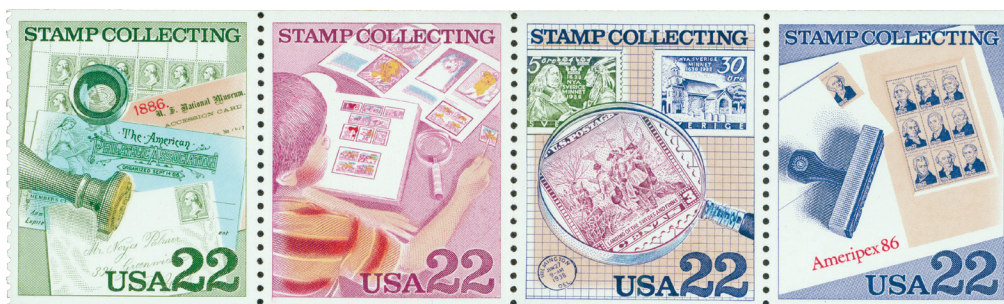
Mint US Error Pane

On January 23, 1986, the booklets were simultaneously issued in Stockholm, Sweden, and State College, Pennsylvania. US representatives attended the Stockholm ceremony and Swedish representatives participated in the Pennsylvania ceremony. During the ceremonies, one US representative stated, “We have so admired Swedish stamps that we used new equipment, new techniques and new dedication to attempt to give our stamps ‘a Swedish look.’” The US stamp booklets were only available for sale for 60 to 90 days.