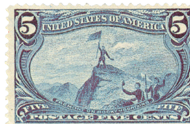
This 1898 Trans-Mississippi stamp pictures Frémont raising the US flag over the Rocky Mountains.

Frémont also served during the Civil War. He was the commander of the Department of the West for five months before being dismissed by President Lincoln. Following the Civil War, Fremont retired from public life to devote himself to finding a possible transcontinental railroad route. In 1878 he was appointed territorial governor of Arizona – a position he held until 1881. He died nine years later in 1890.