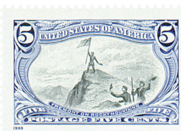
1998 Trans-Mississippi Reprint in Two Colors as originally planned