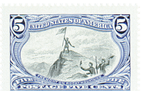
1998 Trans-Mississippi Reprint in Two Colors as originally planned