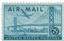
Stamp pictures a plane over the San Francisco-Oakland Bay Bridge. Earhart landed at Oakland Airport.

But Earhart was determined to achieve her goal so she took extra precautions. She removed the passenger seat from her plane and installed extra fuel tanks there. She also set up an advanced two-way radio system to keep in contact with radio operators on the ground.