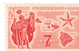
Earhart departed from Wheeler Field, Hawaii, which was one of the targets of the Pearl Harbor attack six years later.