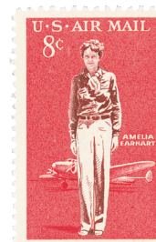
Airmail stamp issued on Earhart's 66th birthday.

On January 11, 1935, Earhart departed Wheeler Field on Oahu, Hawaii despite a light drizzle. She flew through the night and listened to a symphony broadcast over the radio for part of the trip. After 18 hours and 2,400 miles, Earhart landed in Oakland, California the next day. There, thousands of spectators excitedly watched her approach and flooded the runway to congratulate her. She was the first person to successfully complete the trip from Hawaii to California alone. Shortly after, First Lady Eleanor Roosevelt invited Earhart to visit the White House.