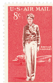
Airmail stamp issued on Earhart's 66th birthday.

Earhart earned national attention in 1928 when she rode as a passenger on a transatlantic flight. But she wanted to earn recognition for her own flying talents, and in the process, help to further the cause of female pilots.